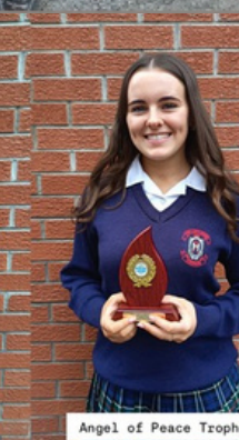
Angel of Peace Trophy