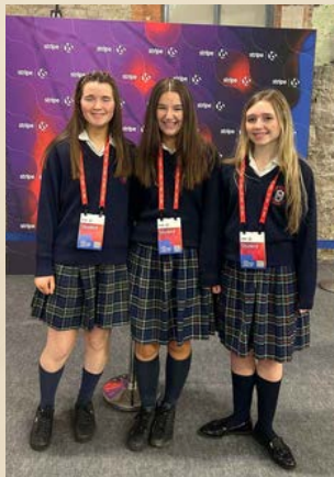
Stripe Young Scientist Exhibition.