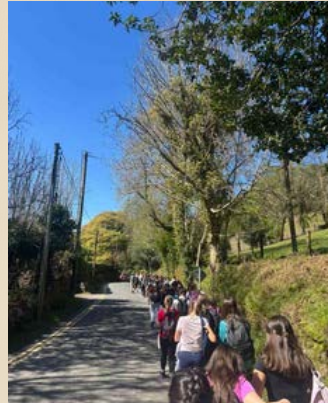
TY Gaisce Hike in Glendalough