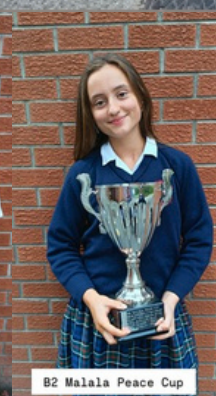
B2 Malala Peace Cup