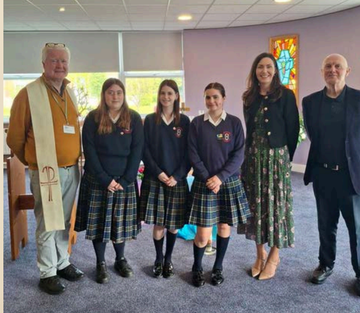
Picture of our new Eucharistic Ministers this term.

That's my prayer for all our students and staff, that we try to follow the example of Mary in our daily lives in the way we treat ourselves and others. It is only when we accept that God loved us first that we can fully accept ourselves and pass on that tender, loving care to others.