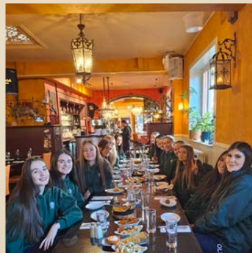
The LCA Spanish class eating Spanish tapas.