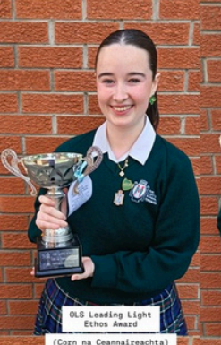
OLS Leading Light Ethos Award (Cozn na Ceannaireachta)