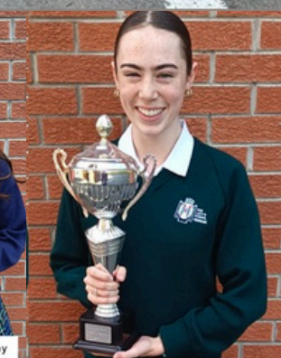
OLS Academic Excellence Cup