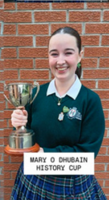
MARY O DHUBAIN HISTORY CUP