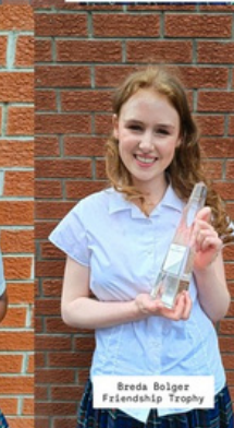
Sreda Bolger Friendship Trophy