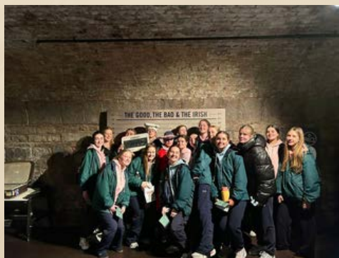
TY trip to EPIC Museum.