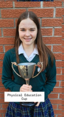
Physical Education Cup