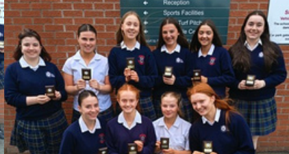
4th & 5th Year Academic Achievement Awards