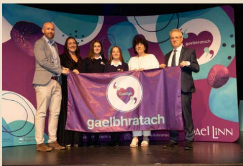
Coiste received the Irish flag.