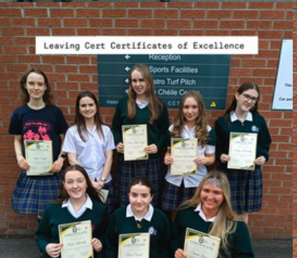
Leaving Cert Certificates of Excellence