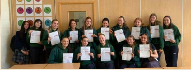
5th Year LCA received their results.