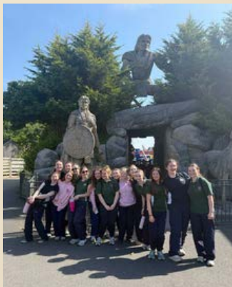
TY trip to Emerald Park.