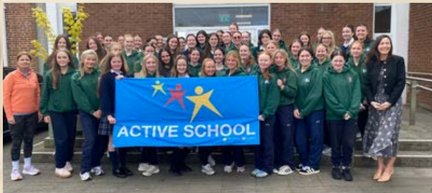
OLS were awarded the Active School Flag.