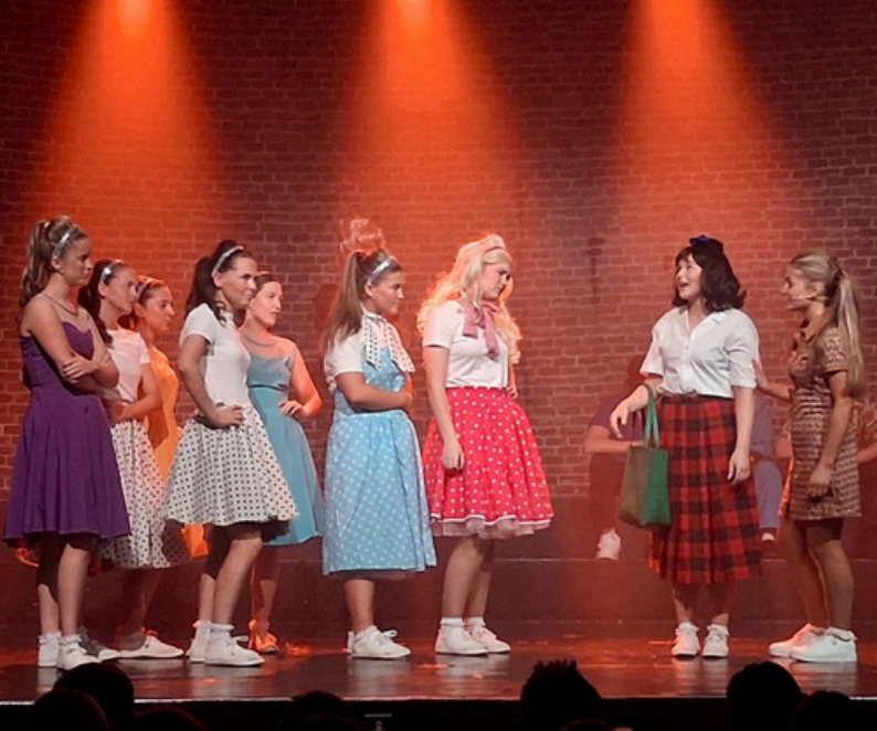
TY students took part in Terenure College's production of 'Hairspray'.