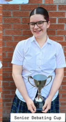
Senior Debating Cup