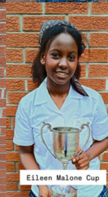
Eileen Malone Cup