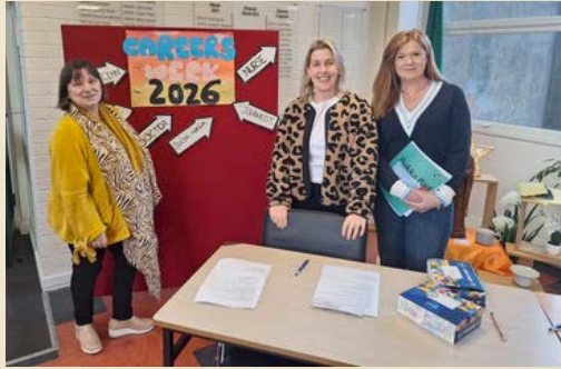
OLS Careers Expo.