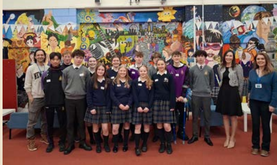
TYs collaborated trialled an app based on career investigation.