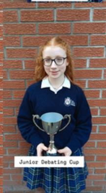
Junior Debating Cup