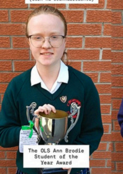
The OLS Ann Brodie Student of the Year Award